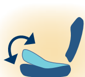
Seat & Thigh Support