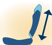
Backrest Height Adjustment